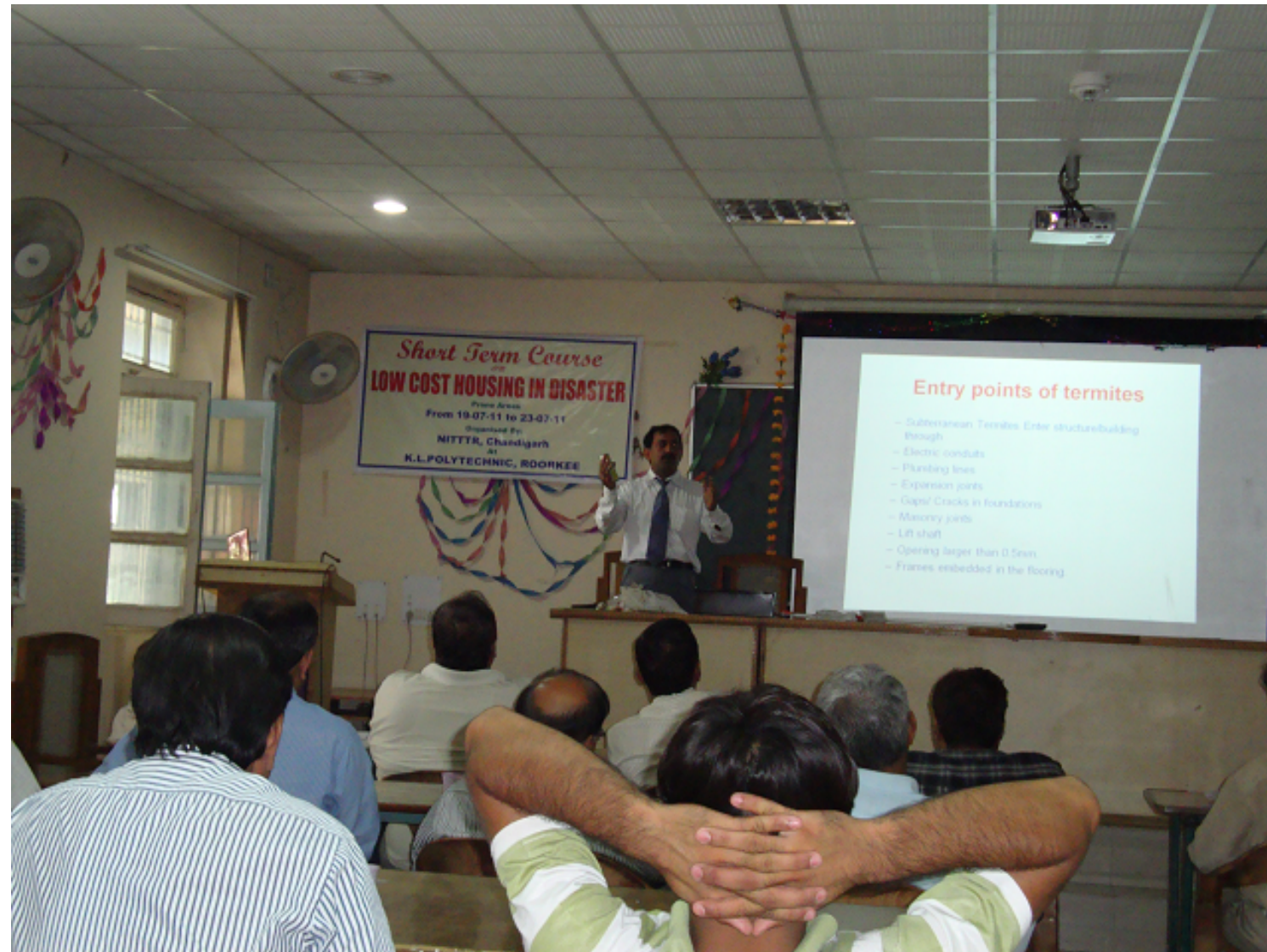
GIVING TRAINING AT K L POLYTECHNIC , ROORKEE