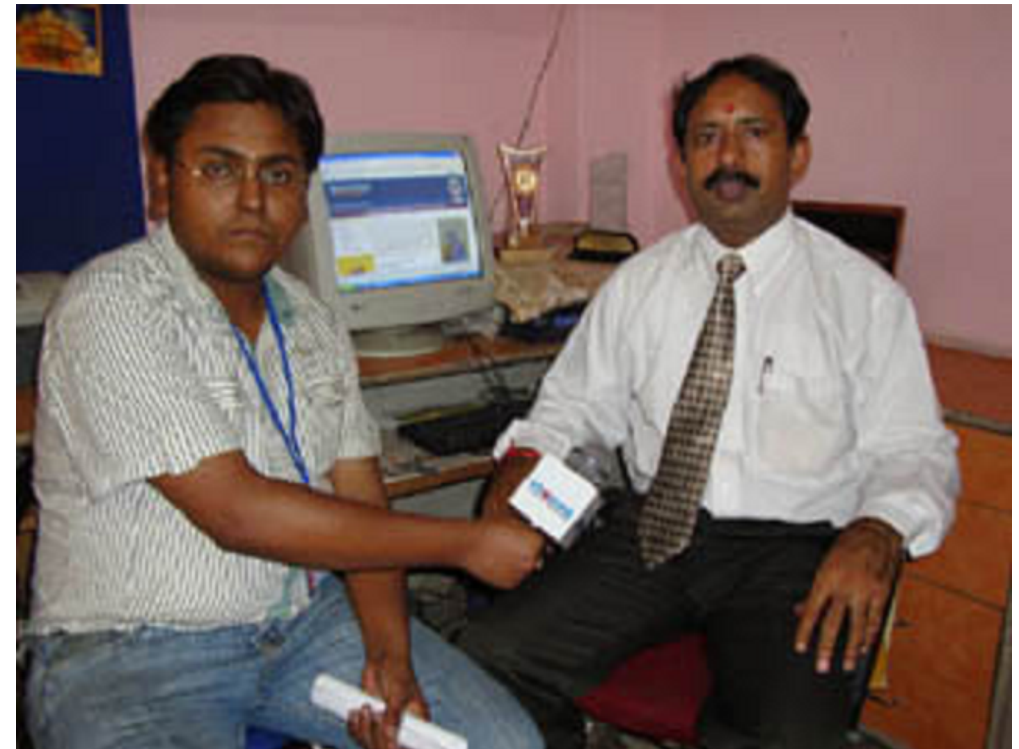
PEST CONTROL VIEW ON TELE VISION